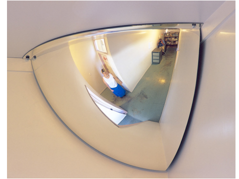
▶ Factory Corridors