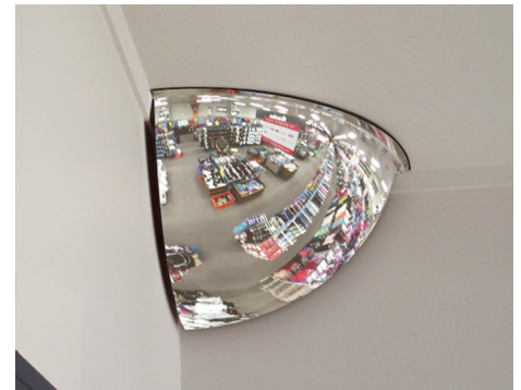
▶ Retail Observation