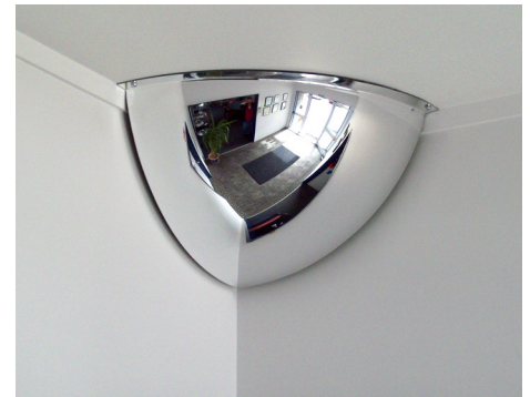
▶ Reception Entrance