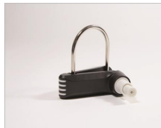
FORSTAG PADLOCK 2