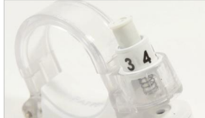
Visual identification of the price range by the staff