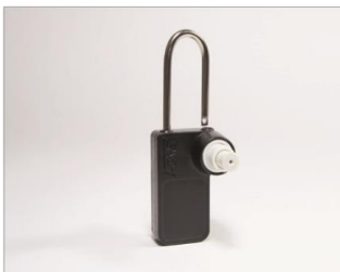
FORSTAG PADLOCK 3