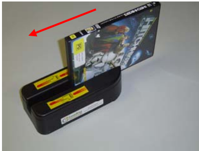
1. Slide the One-Time case through the channel following directional arrows featured on top of the release unit. (The DVD front cover should face the side WITHOUT the key lock).