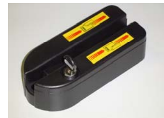
Turn key to activate channel block