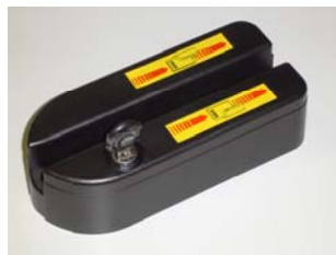
Insert key in lock

Note : the unit is supplied with two keys that are numbered to match the serial number of the unit and are unique to each unit. Please ensure keys are matched to each unit and kept safe and secure.