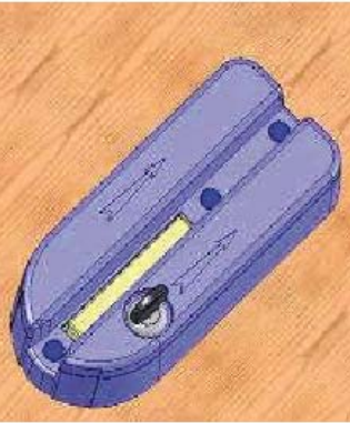
3. Conceal screws with plastic caps provided.